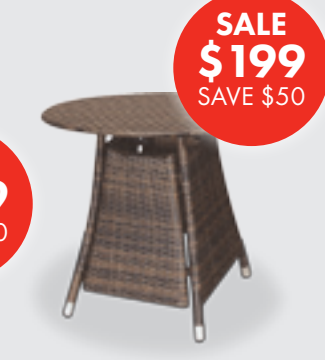
TASMAN 60cm Round Woven Wicker Side Table – mixed taupe