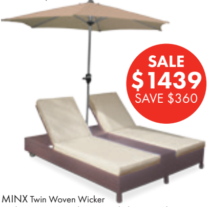
MINX Twin Woven Wicker Sunloungers – mixed taupe. Includes 2.5m tilt Olefin umbrella (UV90+). Sold complete.