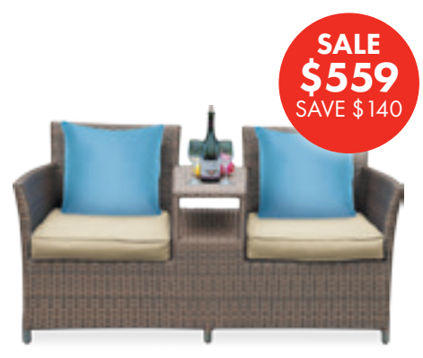
LUCCA 2 seater Woven Wicker Combo – mixed taupe. Sold complete.