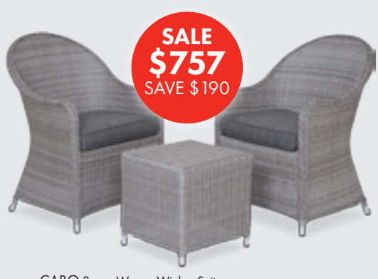
CABO 3-pce Woven Wicker Suite – grey wash. 45cm Cabo square table. Available separately.