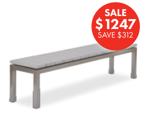
African Teak & Stainless Steel Bench - sand blasted and white washed