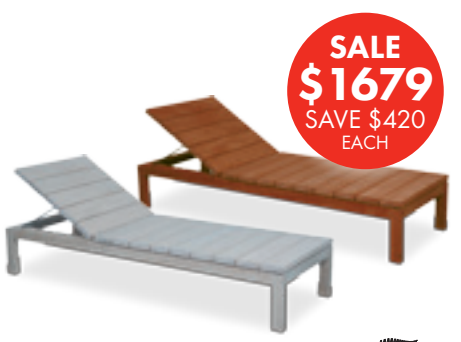
PACIFIC African Teak Sunlounger – sand blasted and white washed or jarrah stain. Optional cushion available.