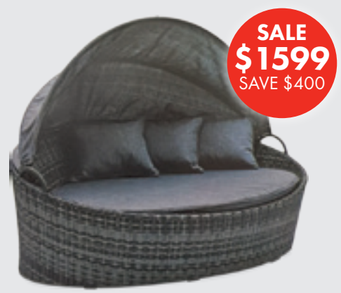
MELROSE Woven Wicker Day Bed – mixed taupe