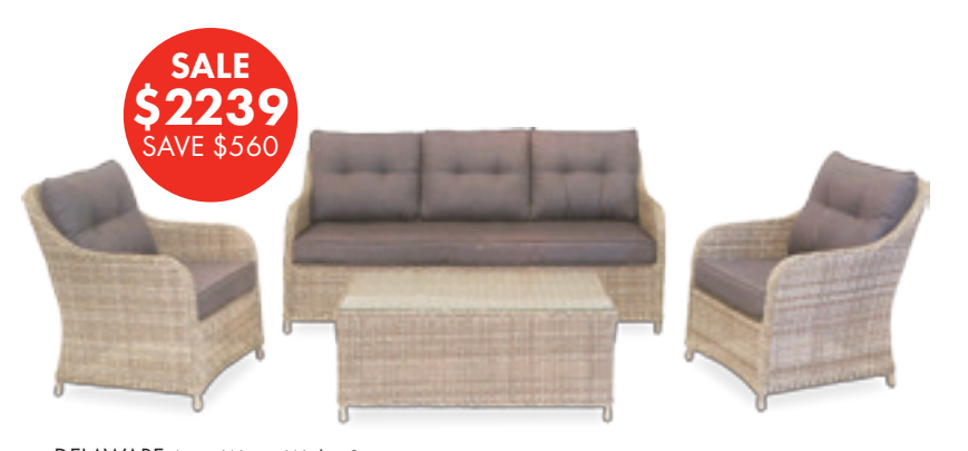
DELAWARE 4-pce Woven Wicker Suite – Kyoto taupe. Glass table top. Sold complete.