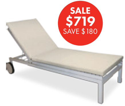
RAVEN Aluminium Sunlounger - white