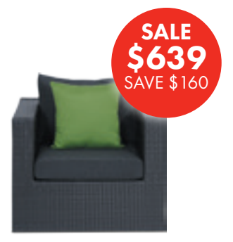
MODE Woven Wicker Chair – dark mocha. 86w x 85d x 67h cm