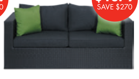
MODE Woven Wicker 2 seater XL – dark mocha. 170w x 85d x 67h cm