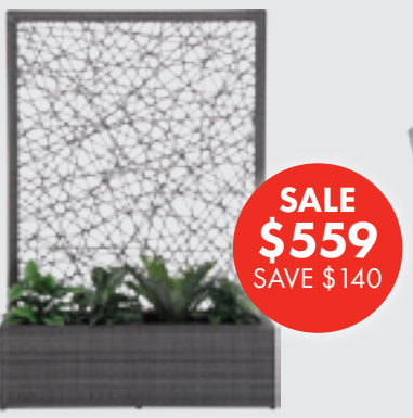
PLANTER with Woven Wicker Screen – fog swirl. (Excludes plants.)