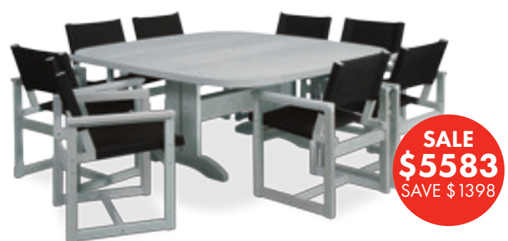
SQE 1650 Square African Teak Table and E2 Chairs – sand blasted and white washed. Available separately.