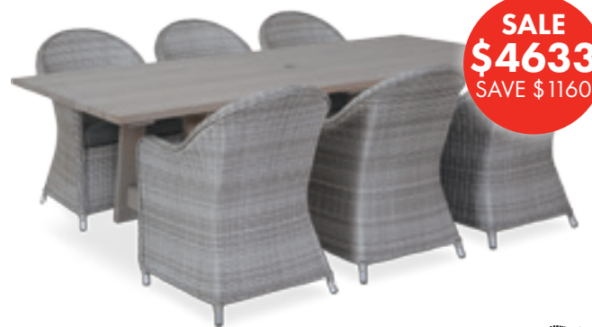
CABO 2400 African Teak Table and CABO Chairs - sand blasted and grey washed. Available separately. (Table only is NZ made)