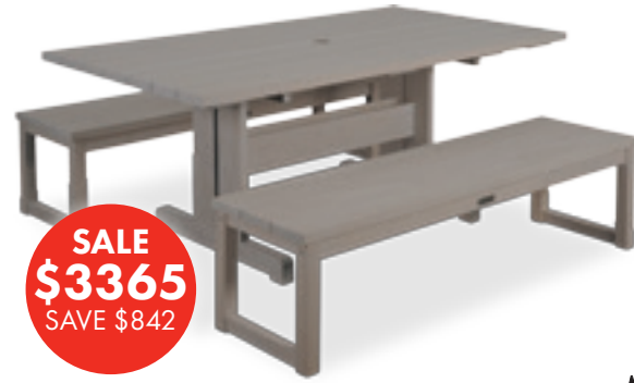
PACIFIC 1700 Oblong African Teak Table and PACIFIC 1500 Benches – sand blasted and grey washed. Available separately.