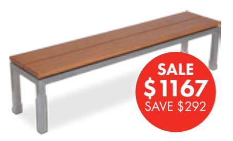
COAST 1800 Rosewood & Stainless Steel Bench - natural stain