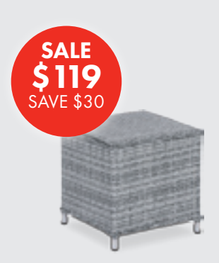
CABO 45cm Square Woven Wicker Side Table – grey wash