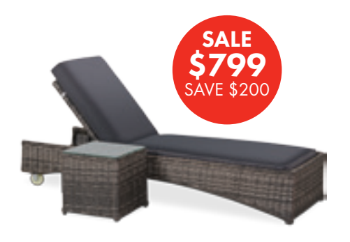
BAHAMAS Woven Wicker Sunlounger and Side Table – mixed taupe