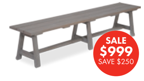
CABO 2200 African Teak Bench - sand blasted and grey washed