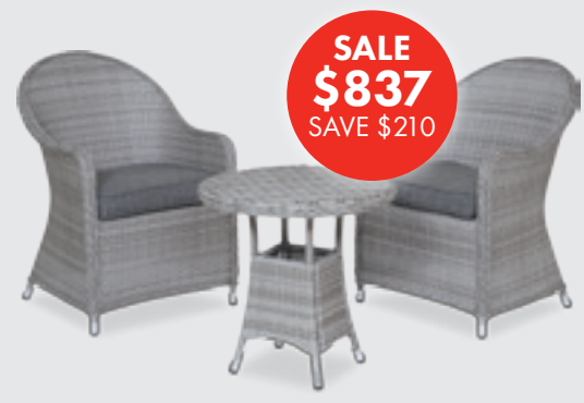
BAJA Round Woven Wicker Table and CABO Chairs – grey wash. 60cm Baja round table. Available separately.