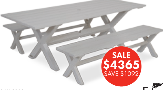
BALI 2200 Oblong African Teak Table and BALI 1800 Benches - sand blasted and white washed. Available separately.