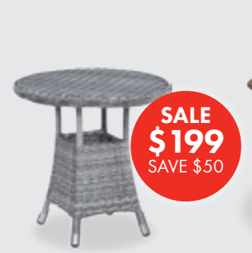
BAJA 60cm Round Woven Wicker Side Table – grey wash