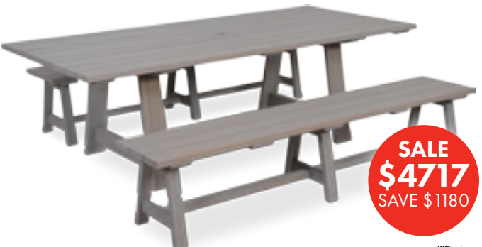
CABO 2400 Oblong African Teak Table and CABO 2200 Benches – sand blasted and grey washed. Available separately.