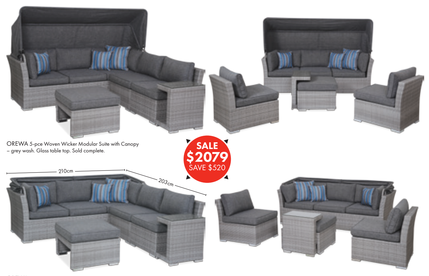
OREWA 5-pce Woven Wicker Modular Suite with Canopy (folded down) – grey wash. Glass table top. Sold complete.