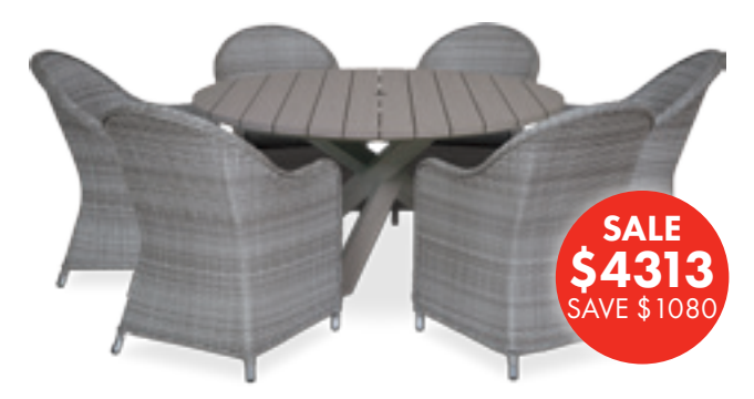
CABO 1600 Round African Teak Table and CABO Chairs – sand blasted and grey washed. Available separately. (Table only is NZ made)