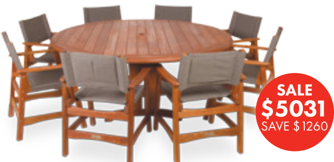
EDEN 1800 Round Rosewood Table and EDEN Chairs - natural stain. Available separately.