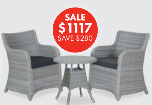
PHUKET Round Woven Wicker Table and BALI Chairs – vintage white. 60cm Phuket table. Available separately.