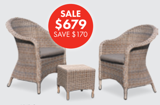
KUDO 3-pce Woven Wicker Suite – taupe. 45cm Kudo square table. Sold complete.