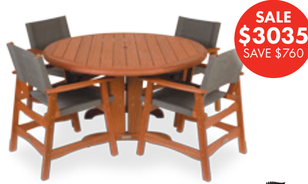
EDEN 1300 Round Rosewood Table and EDEN Chairs - natural stain. Available separately.

COAST 2000 Oblong Rosewood Table and COAST 1800 Benches – natural stain. Stainless steel 304 grade NZ made frame. Available separately.