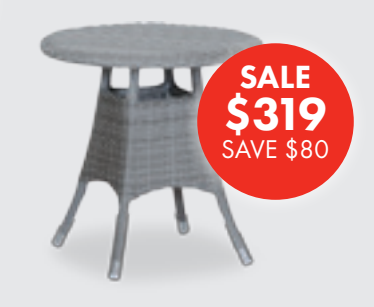
PHUKET 60cm Round Woven Wicker Side Table – vintage white