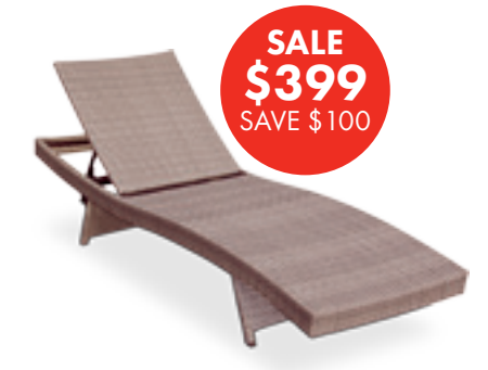
CAYMAN Woven Wicker Sunlounger – mixed taupe