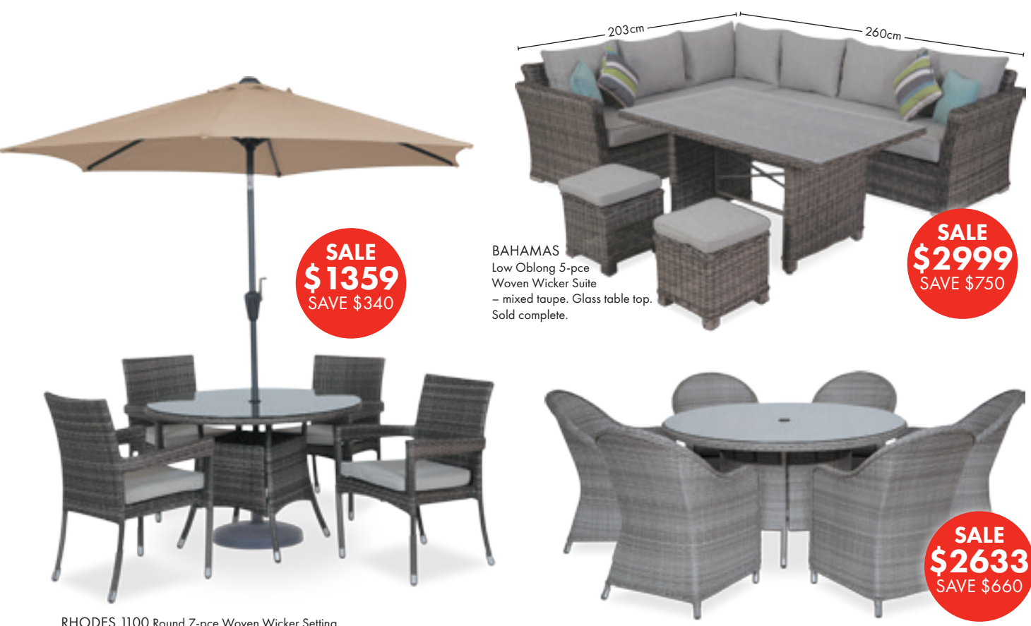
RHODES 1100 Round 7-pce Woven Wicker Setting – mixed taupe. Glass table top. Includes 2.5m Olefin umbrella (UV90+) and base. Sold complete.