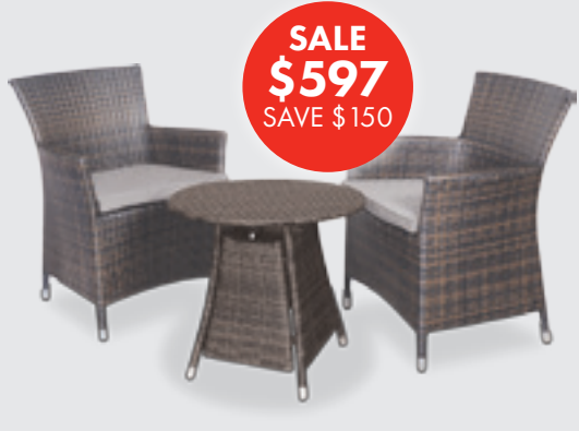
TASMAN 3-pce Woven Wicker Suite – mixed taupe. 60cm Tasman round table. Available separately.