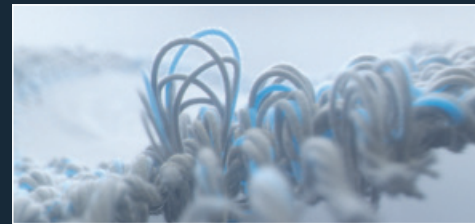
Smart Fabrics Intelligent SmartTex ® fabric draws away moisture to cool and regulate your sleep climate