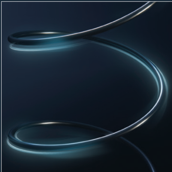
Titanium Align-Support ® System Intuitive coils sense and respond, aligning your body in its natural posture for deep rejuvenating sleep