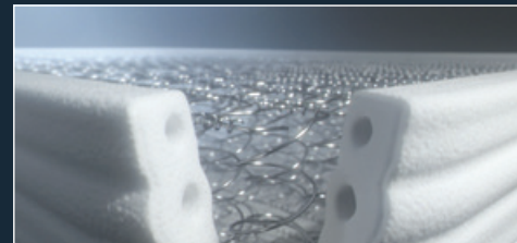
Reinforced Edge Four walls of UniCased ® or UniCased ® XT edge support increases the sleep surface