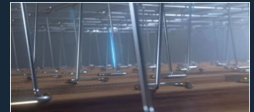
Endurance Base Meticulously crafted, stress absorbing base for deeper, longer-lasting comfort